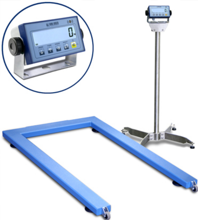
EPWL with optional column

NOTES: weight indicator is suitable for installation on the table, column, wall or attached to the structure.