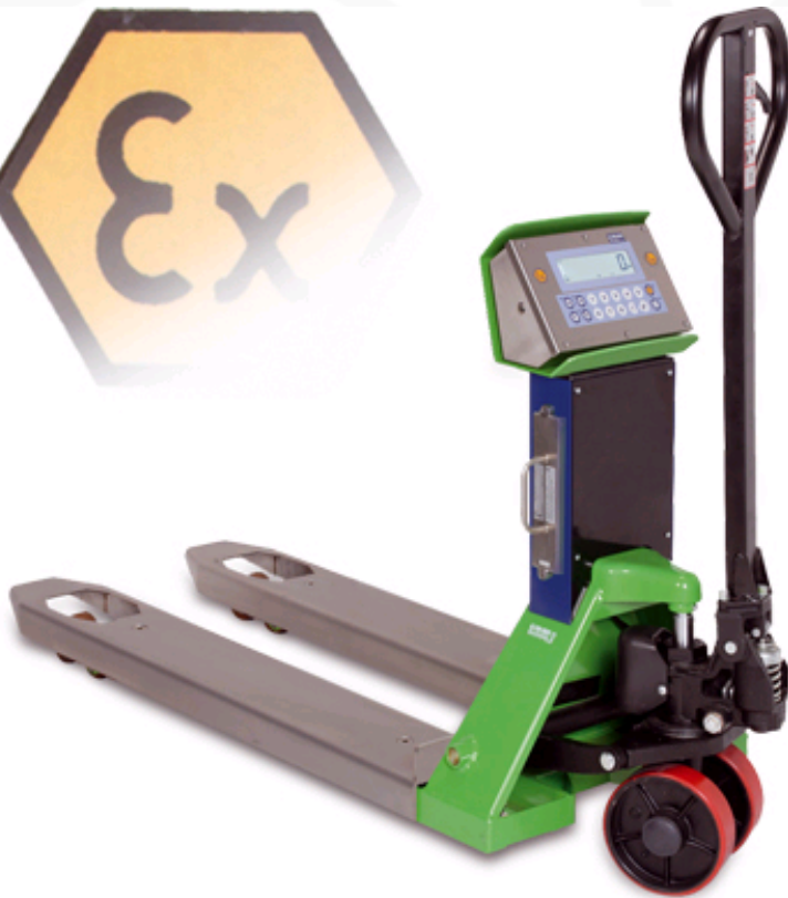
TPWX with optional STAINLESS STEEL forks.